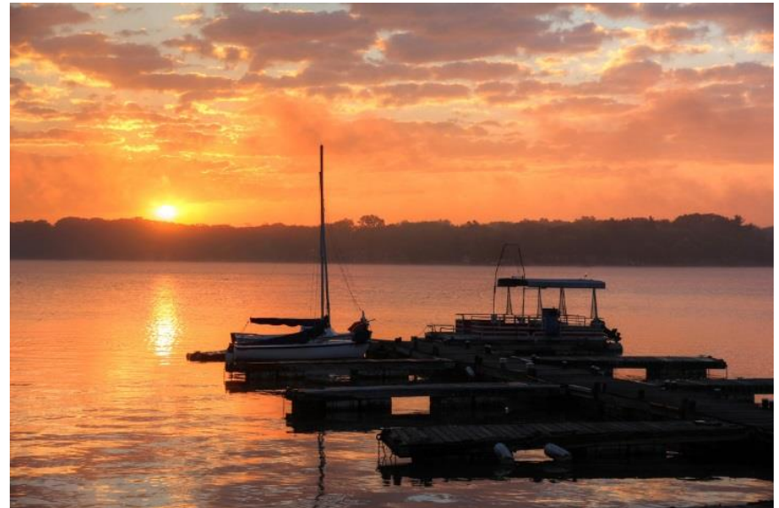
Photo: Lake Decatur

The Decatur Park District and the City continue to work together to bring a new face and amenities to the Nelson Park lakefront. The Park District recently opened a new waterpark and hopes to add new restaurants and recreational amenities, boat docks and other exciting family-oriented activities. Most recently, the City of Decatur and the Park District have enlisted a private partner to expand the lake's marina and offer additional services for lake users.