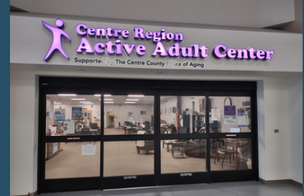
Active Adult Center

The Centre Region Council of Governments is an Equal Opportunity Employer.