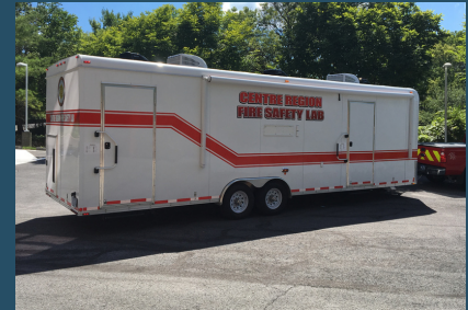
CRCA Safety Trailer