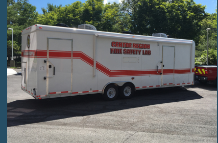
CRCA Safety Trailer