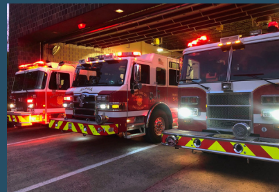
Alpha Fire Station