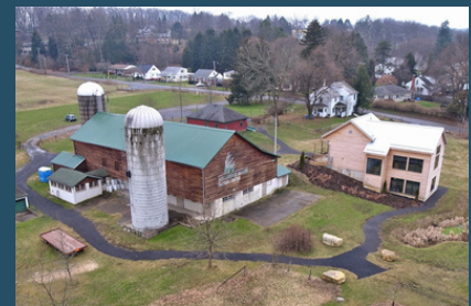
Millbrook Marsh Nature Center