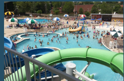
CRPR - Welch Pool