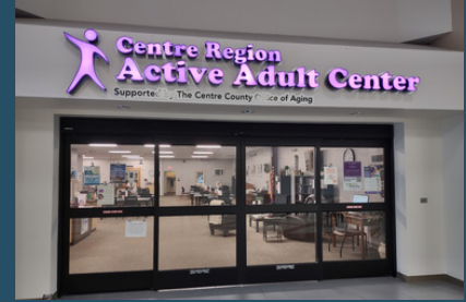
Active Adult Center

The Centre Region Council of Governments is an Equal Opportunity Employer.