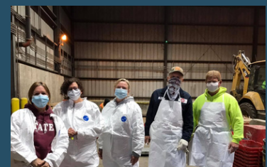
Refuse and Recycling