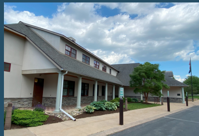
Centre Region COG